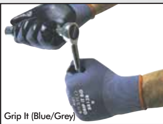
Grip It (Blue/Grey)