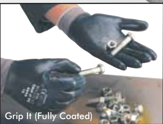
Grip It (Fully Coated)